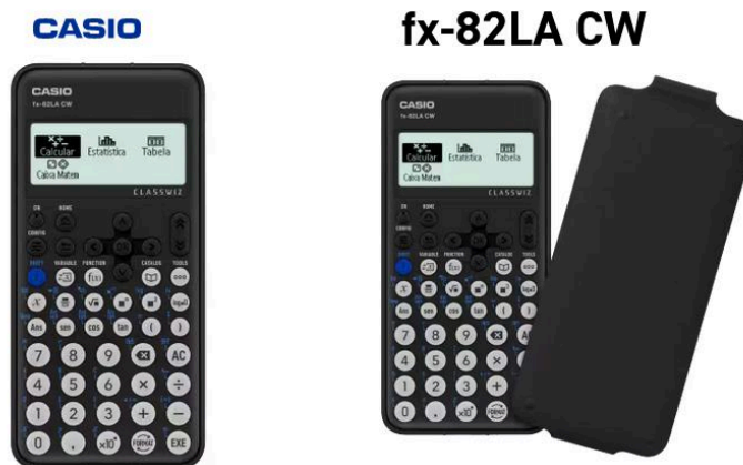
Standard Scientific Calculator

The CASIO Standard Scientific Calculator model fx-82LA CW will be provided to all competing students, as shown in the following image.